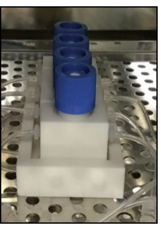
Fig. Multiple chamber assembly

For example, this bioreactor is an excellent model to study the migration and attachment of cancer cells to bone tissue, subsequent cancer cell growth, and overall host cell response, simultaneously.