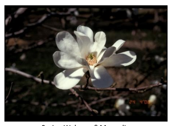
Spring Welcome® Magnolia